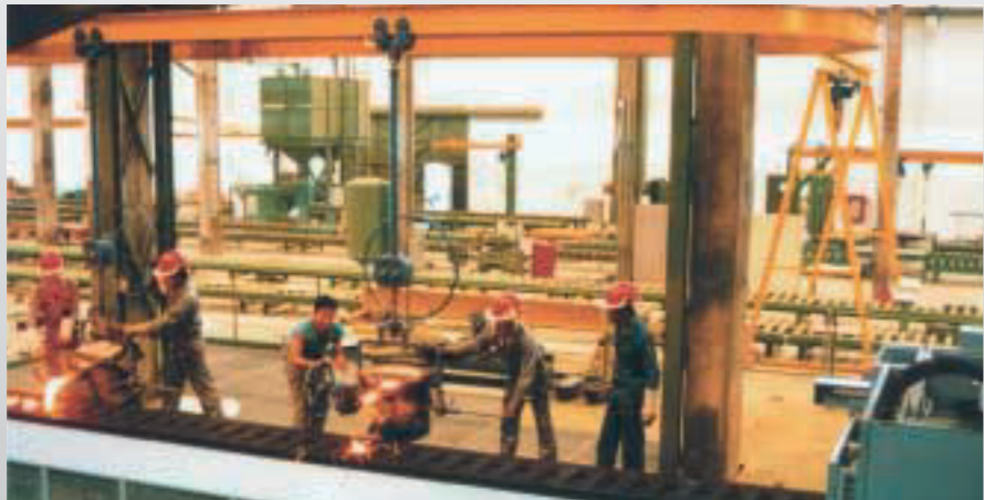
'88, PT PINDAD , Indonesia, the turn-key realisation of a ductile castings foundry, for the production of railway- and heavy machine tool parts and components