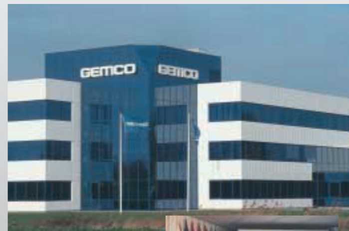
'91, the inauguration of the new head-quarters in Eindhoven, The Netherlands