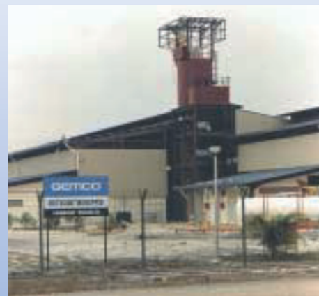
90's, HICOM , Malaysia Gemco built an automotive product foundry, including machining facilities