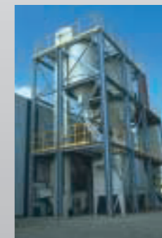
'02, LFF3 , The Netherlands conception, development and realisation of a modular lost foam plant with casting line plus sand system