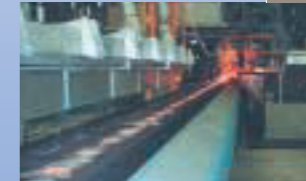
'00, supply and installation of a complete production line around two vertical moulding machines