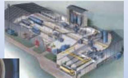
'98, RASSINI Mexico, turn-key foundry project for brake discs