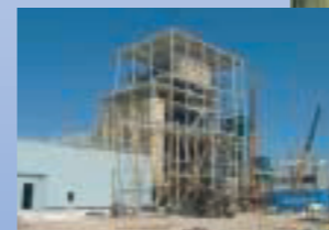
turn-key sand plant