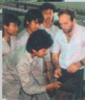
PMS Bandung Foundry Training Institute the implementation of a Foundry Training School was a significant contribution to the education of young Indonesian foundry technicians. For several years, Gemco experts trained future Indonesian foundry experts. The project included cupola melting, induction melting, machine and hand moulding, fettling department as well as a laboratory and pattern shop