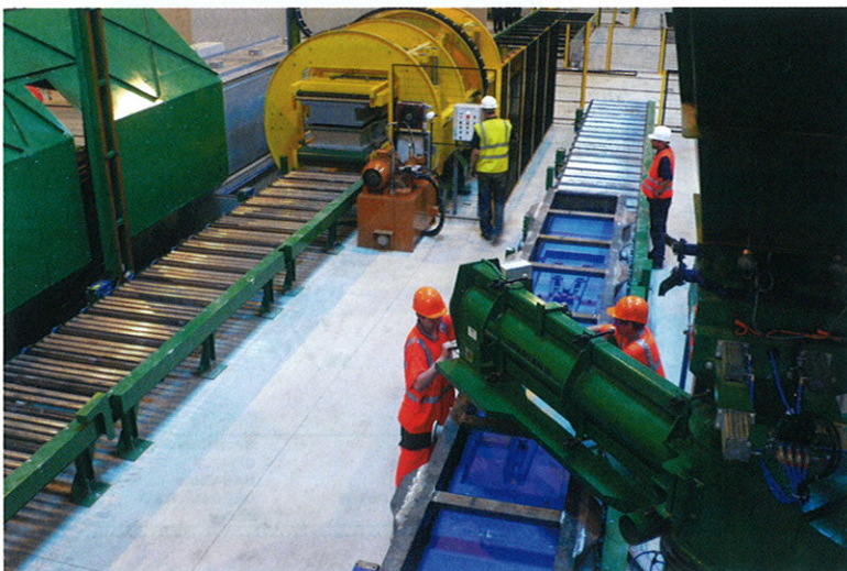
Omega mixing and stripping line

In order to maximise efficiency, all castings are made on one moulding line which utilises flasks with standard dimensions. To reduce manual handling