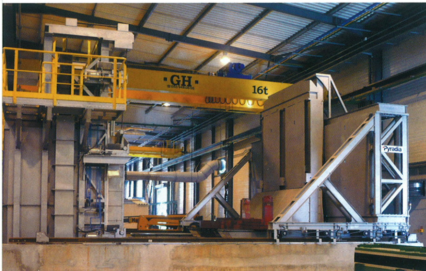
HT-furnace automated manipulator

the transfer car ready for loading to repeat the cycle on the pouring/cooling line).