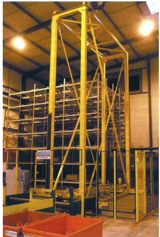
Pattern storage manipulator

Gemco is an independent company and provides for the latest technology in engineering and design process tools, such as simulation of foundry logistics and 3D modelling with an emphasis on efficiency, energy and environment.